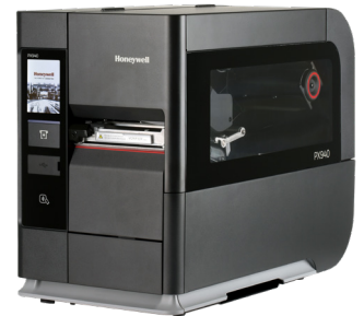
PX940 High-Performance Industrial Printer with Integrated Label Verification