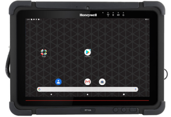
RT10 Rugged Tablet