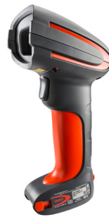
Granit 1980 Industrial-Grade Full-Range Area-Imaging Scanner