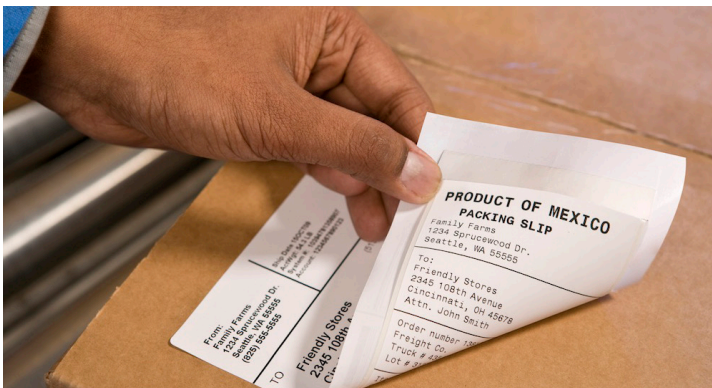
Cold Chain Food Labels

Run a full physical inventory in nearly half the time using DeltaOne's Automated CycleCount. A single operator sled, which sits on a forklift or turret truck, automatically counts inventory while simultaneously cross-referencing it against anticipated inventory. Corrections to inventory can be executed in real-time or applied later.